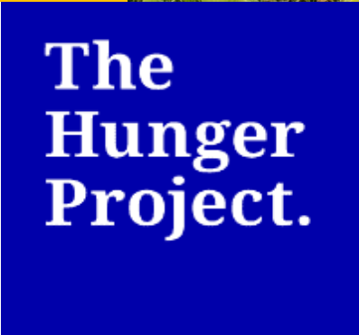
Burkina Faso, 2023

Hunger is about more than food. It's about people.