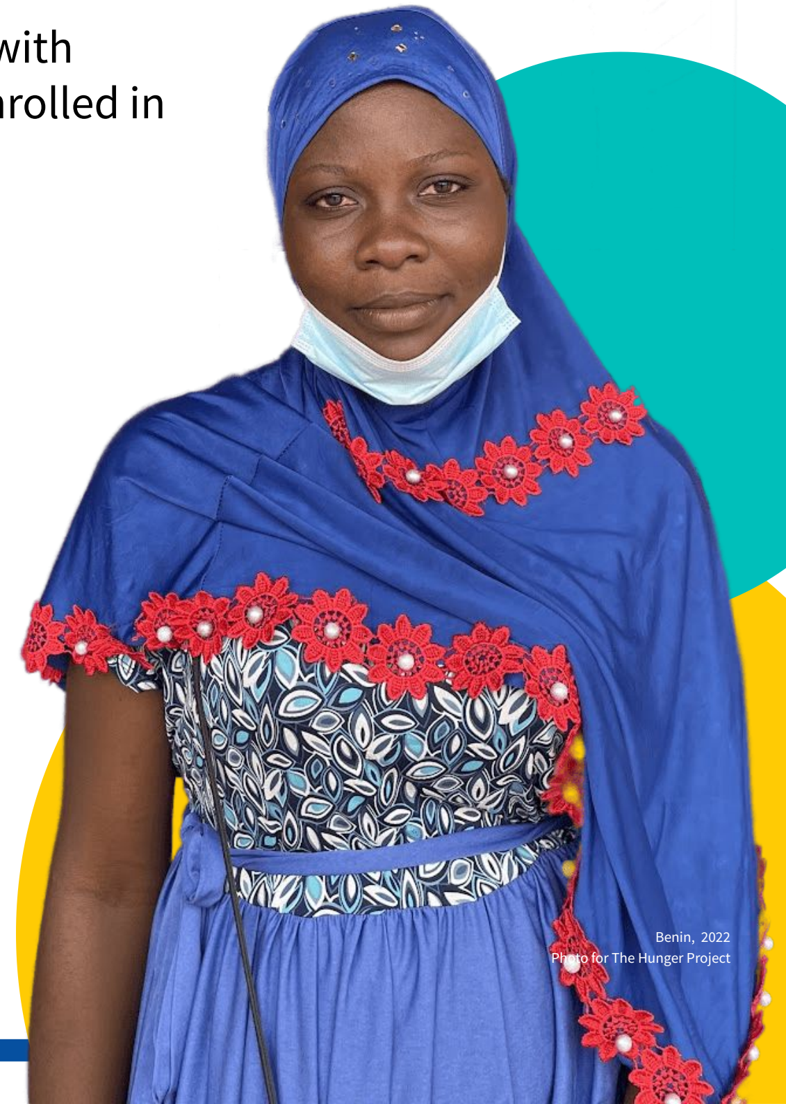
Benin, 2022

As an animator, he shared information and trained his community in soil productivity conservation, shift cultivation and new farming methods to withstand climate shocks. Within our work, we are dedicated to ending hunger through climate adaptation and resilience programs to drive community-led innovation and strategies against climate change.