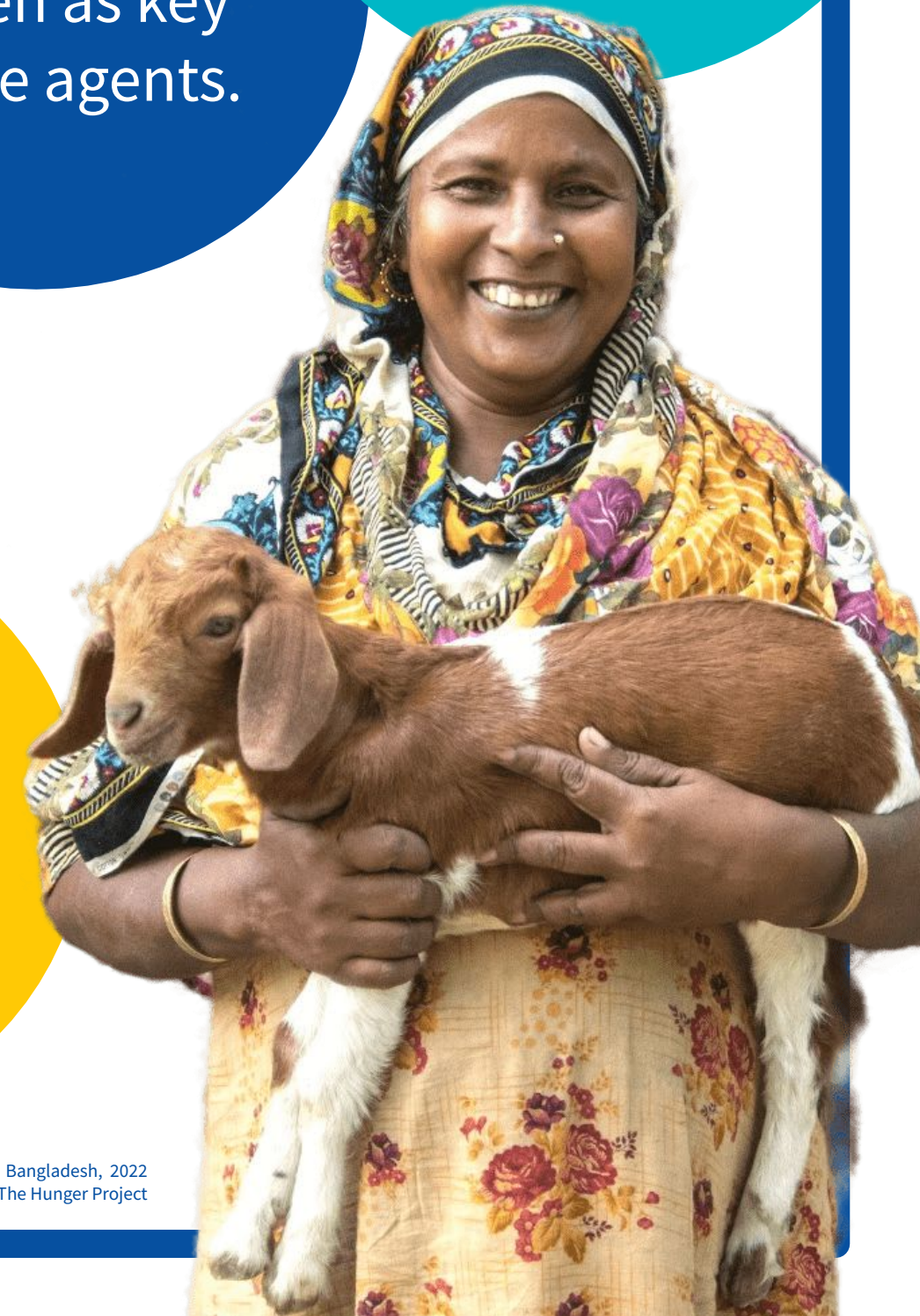
Bangladesh, 2022 Photo for The Hunger Project