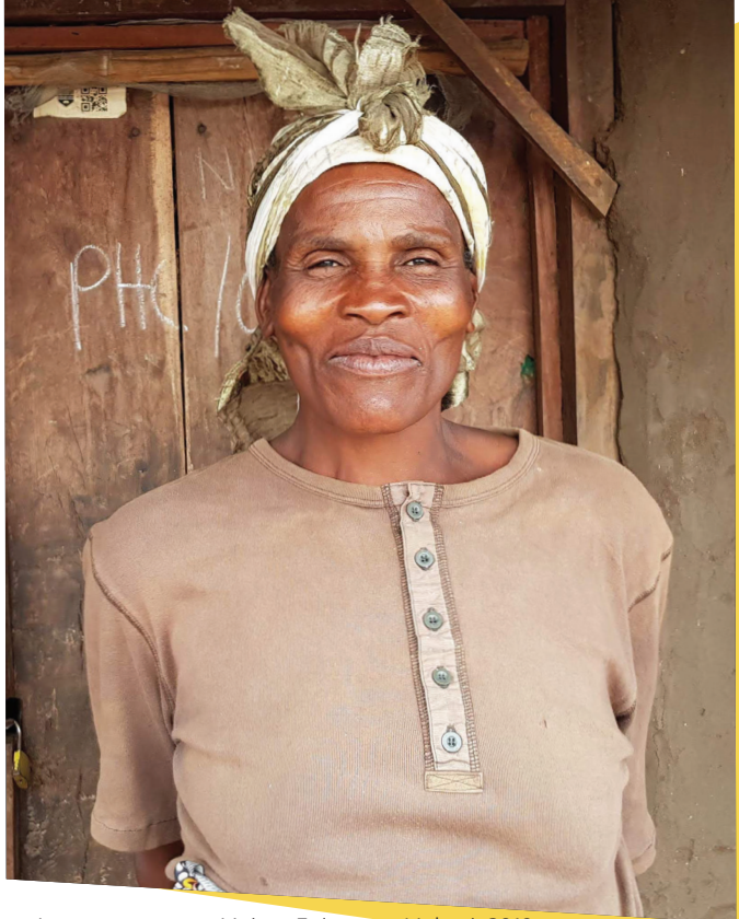
Malaria Animator at Majete Epicenter, Malawi, 2018

In 2019, our programs reached 16.5 million people globally.