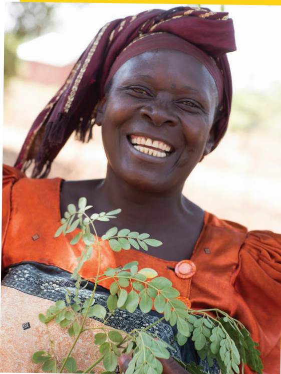
Animator at Iganga Epicenter, Uganda, 2017

Epicenters unite 10,000 to 15,000 people from a cluster of villages, creating a space where communities build the confidence to become leaders — in equal numbers of women and men — of their own development, unlock local capacity for change, and achieve progress on the Sustainable Development Goals.