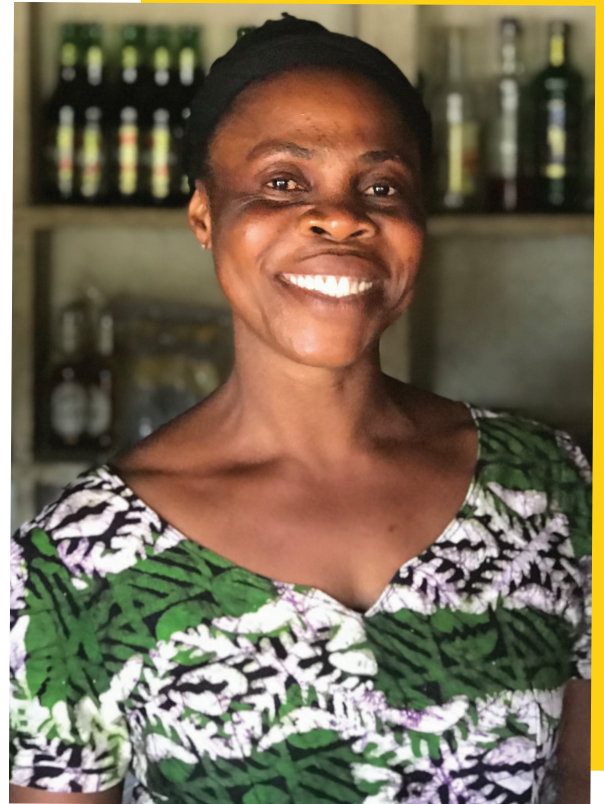
Small business owner, Ghana, 2018

Women leaders at Kissamey Epicenter, Benin, 2019