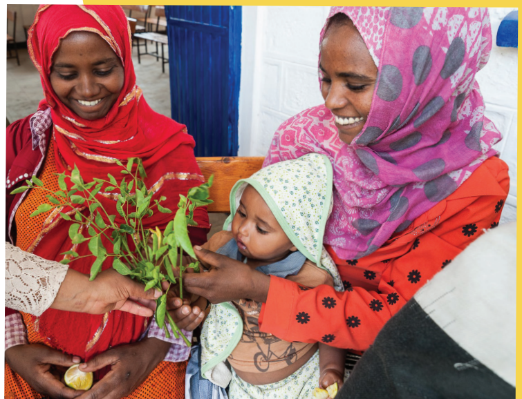
Moringa Farmers at Mesqan Epicenter, Ethiopia, 2017

This community-led, informed analysis allows community members to identify their needs, set their own development priorities, and participate in tracking their progress on these goals over time.